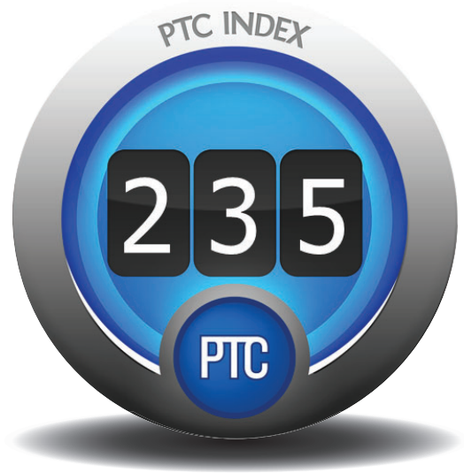
As of 16 APRIL 2024

The Treasure Valley real estate market navigated the impact of spring break with a mix of resilience and adaptation. While building permit filings experienced a slight dip, indicators such as new home sales, existing home sales, refinance activity, and average sales prices point towards ongoing momentum within the market.