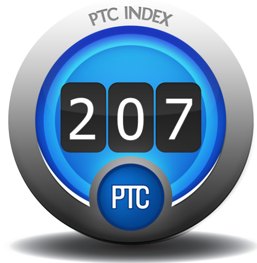
As of 15 March 2024