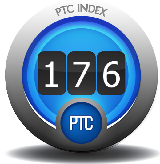
As of 17 January 2024

Refinance activity experienced a notable decrease of 14.5 percent from the previous month, but recent average rate declines may reverse the downward trend in January. Despite fluctuations, the overall real estate market demonstrated stability, with a modest upswing in average sales prices with an increase of about three percent from December to November.