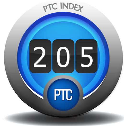
As of 15 November 2023

Lastly, the average sales price for homes in Treasure Valley sits at $546,288, a minor decrease of three percent from last month – compared to October 2022, the average sales price is down nearly five percent. Ada County's average sales price is $640,230, while Canyon County's average is $452,346.