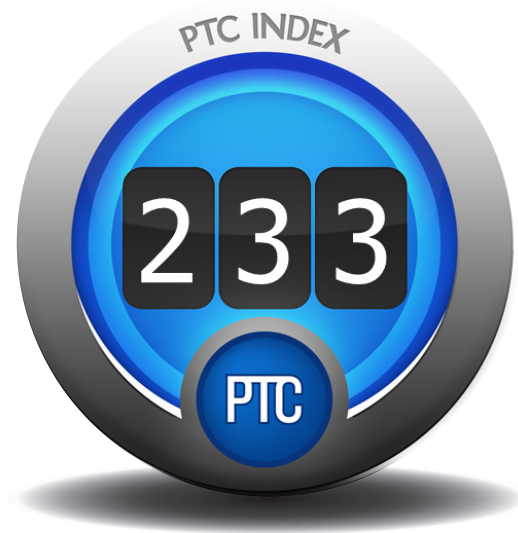
As of 16 October 2023

Lastly, the average sales price for homes in the Treasure Valley sits at $563,275, a less than one percent drop from last month's average sales price. The average sales price for homes in Ada County is $655,004 and Canyon is $471,545.