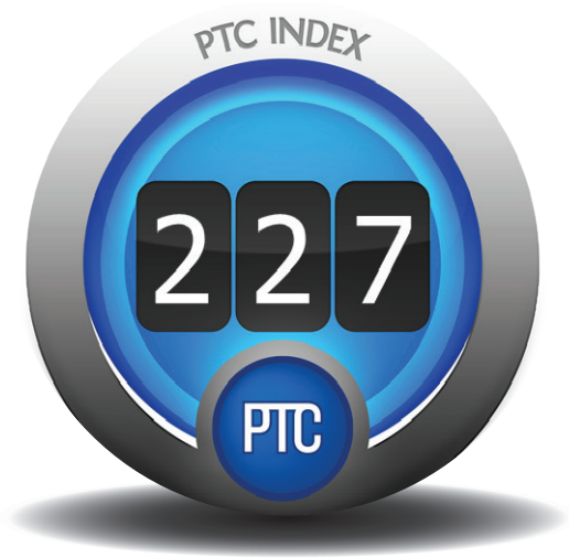
As of 16 August 2023

A lot has stayed the same in the average sales price of homes in the valley, holding steady at $550,964. Ada County's average sales price was $634,311, while Canyon County arrived at $467,616.