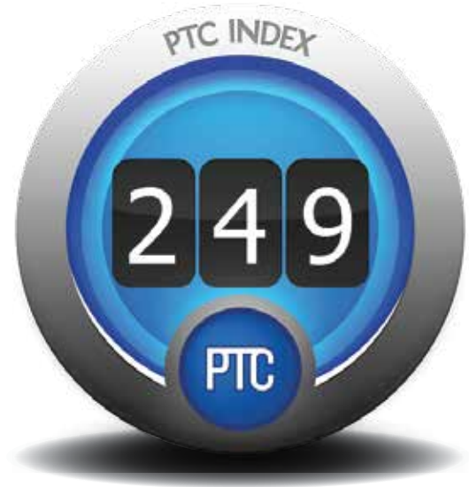
As of 15 June 2023

Lastly, the average sales price for Ada and Canyon counties increased two percent, settling in at $564,525 this month. As we progress towards the last half of the year, some tailwinds may help spur increased activity in our market – at least through the summer months.