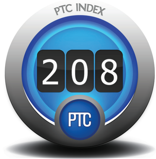
As of 16 March 2023

Lastly, the average sales price for homes in the valley was $519,194, down slightly, just two percent from the month prior; the average sales price is down nine percent compared to a year ago. Ada County's February average sales price was $618,836, with Canyon County's settling at $435,664.