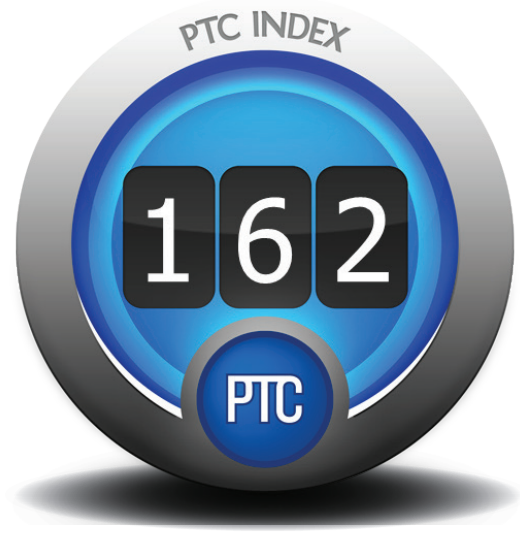
As of 15 February 2023

Lastly, the average sales price for homes in the Treasure Valley landed at $527,250 – a decline of about two percent from last month. Ada County posted at $618,836 for its average sales price, while Canyon County landed at $435,664.