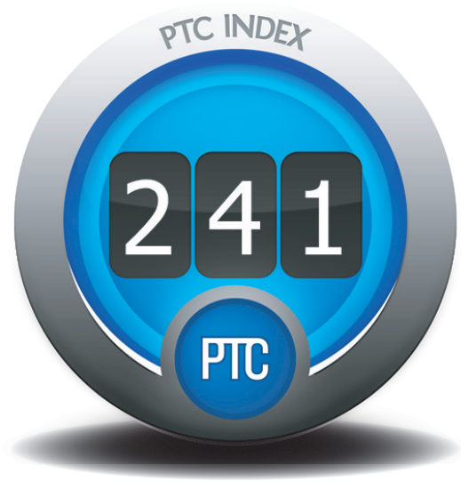
As of 18 August 2022

For the second consecutive month, the average blended sales price for Ada and Canyon Counties inched downward about three percent to $588,860. For July, Ada's average was $684,472 while Canyon's was $492,888 representing a decline from June of about three percent and two percent, respectively.