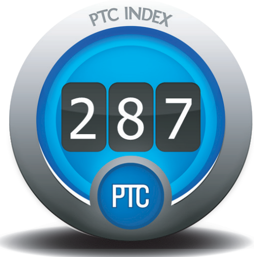
As of 14 July 2022

* Data source: • 14 July 2022