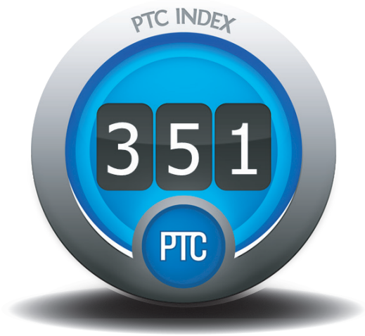
As of 17 March 2022

Finally, the average sales price for homes in the Treasure Valley is $571,761, a near four percent increase from last month. Ada County's average sales price was $649,378 and Canyon's at $494,144.