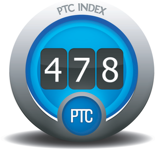
As of 22 November 2021

Finally, the average Treasure Valley sales price landed at $538,657 in October versus September's average of $538,724 – a difference of $67. Ada County's average sales price landed at $615,659 while Canyon's average sales price arriving at $461,655. In the year ago time period Ada County's and Canyon County's average sales prices were $484,818 and $359,154, respectively.