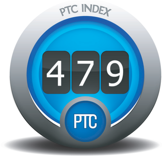
As of 13 August 2021

Refinance activity fell both in the previous month and year-ago time frame by 14 percent 16 percent, respectively. Overall, refinance volume remains robust but may post continue to post further incremental declines in the coming months. Lastly, although the market pace seems to be slowing, prices are still on the rise; the combined average sales price in Ada and Canyon counties is $540,888, up nearly two percent from June. Ada County's average sales price is $632,333 while Canyon's average sales landed at $449,443.