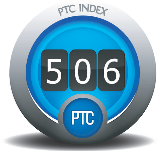
As of 14 July 2021

Refinance remains steady with over 3,000 filings last month while the average days-on-market remain unchanged. Finally, the average sales price for homes in Ada County and Canyon County landed at another record high of $530,864, an upsurge of ten percent from the month of May. Average sales price in Ada County is an astounding $609,974. With Canyon County average sales price at $451,753.